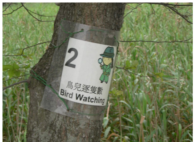
This marker on the tree prompted the WWF volunteers to ask the students to follow the instructions on the Wetland Detective worksheet to count the various types of birds.