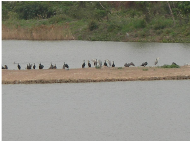
A number of Great Cormorants and a few Little Egrets rested on a small island in the middle of a lake.