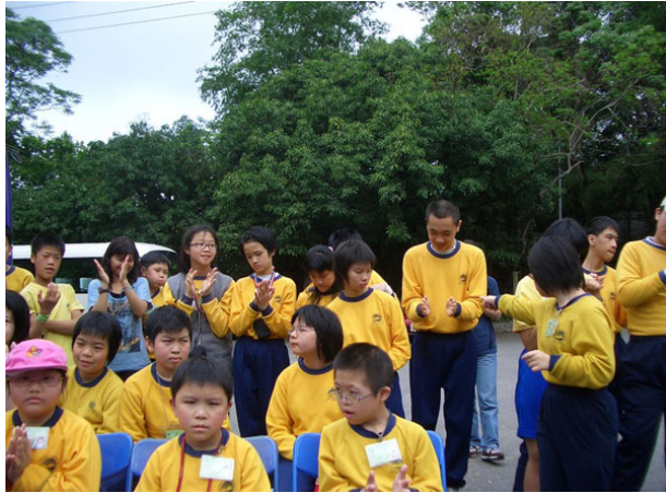
The students of the Hong Chi Winifred Mary Cheung Morninghope School waited anxiously before the inception of the first Learning Tour of the project.