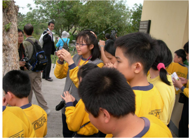
Most of the students brought cameras and binoculars with them so they could take photos of and get in touch with the wildlife of the Mai Po Nature Reserve.