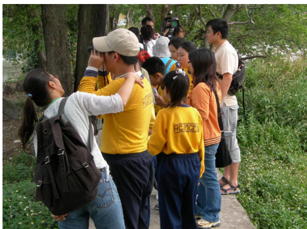
A WWF volunteer helped a student to spot a Great Egret .