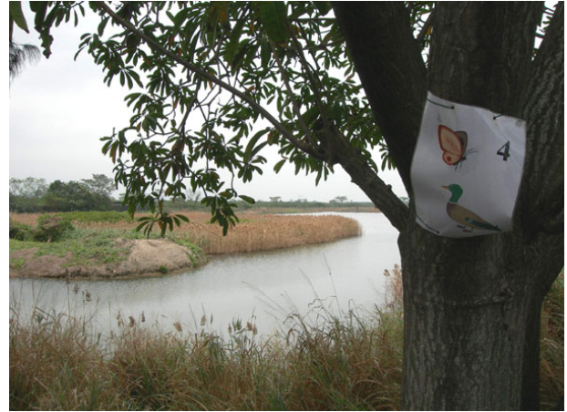
This marker prompted the WWF volunteer to ask the students to watch out for butterflies and Little Grebe that frequented the Mai Po Nature Reserve marshes.