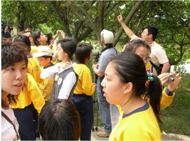
A WWF volunteer explained to the students about the Mangrove communities in the Mai Po Nature Reserve. He showed the students a Cerbera manghas tree, which bears poisonous fruits.