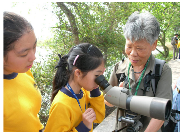
A volunteer from the Hong Kong Bird Watching Society helped a student to use a telescope to observe a Black-winged Stilt .